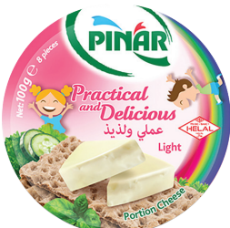
LIGHT TRIANGLE CHEESE