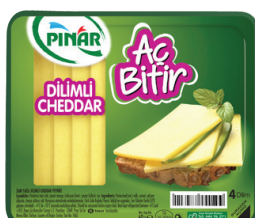
AÇ BİTİR SLICED CHEDDAR

60gr Shelf Life is 4 months. It should be stored at 4-10°C