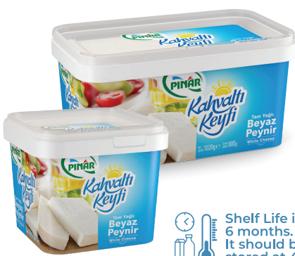
PREMIUM WHITE CHEESE

Shelf Life is 6 months. It should be stored at 4-10°