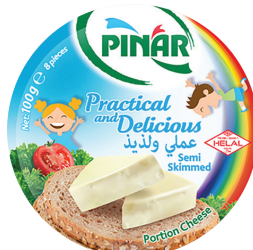
HALF-FAT TRIANGLE CHEESE

Shelf Life is 12 months. It should be stored at 4-10°