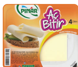
AÇ BİTİR SLICED KASHKAVAL

Those who want to have a healthy and practical diet while the day flows fast can experience ease with Pinar Aç- Bitir Sliced Cheese 60g.