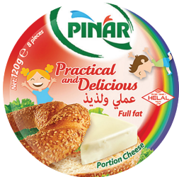
WHOLE TRIANGLE CHEESE

A practical taste that you can always carry with you everywhere (at school, at work, at picnics) and can be consumed easily.