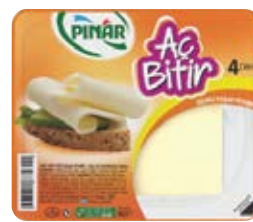
AÇ BİTİR SLICED KASHKAVAL

Those who want to have a healthy and practical diet while the day flows fast can experience ease with Pinar Aç- Bitir Sliced Cheese 60g.