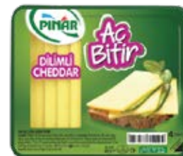
AÇ BİTİR SLICED CHEDDAR